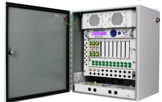
Outdoor Unit (ODU)