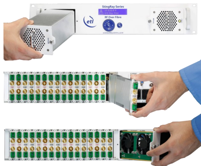
Indoor chassis showing hot-swap power supply modules, fibre modules & fans