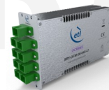
Multiplexer / Demultiplexer Module